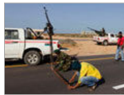
Libyan fighting rages on