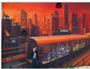
Impressive graffiti art