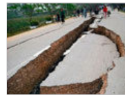
Myanmar's devastating quake